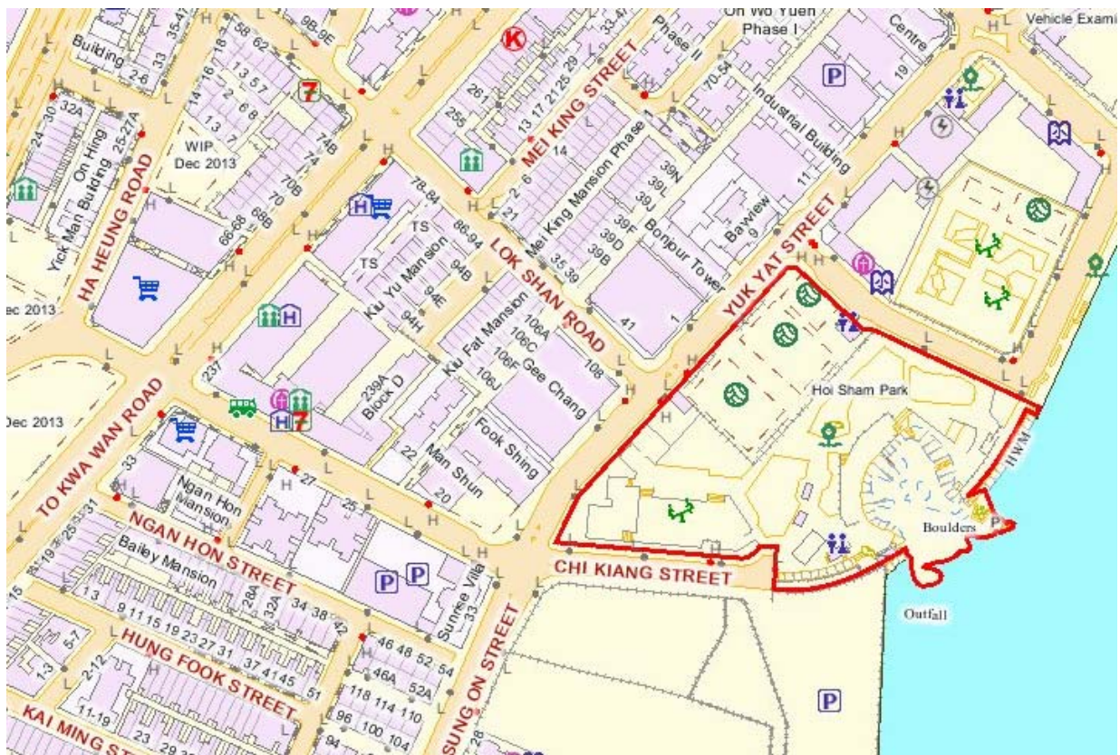
(Not to scale)