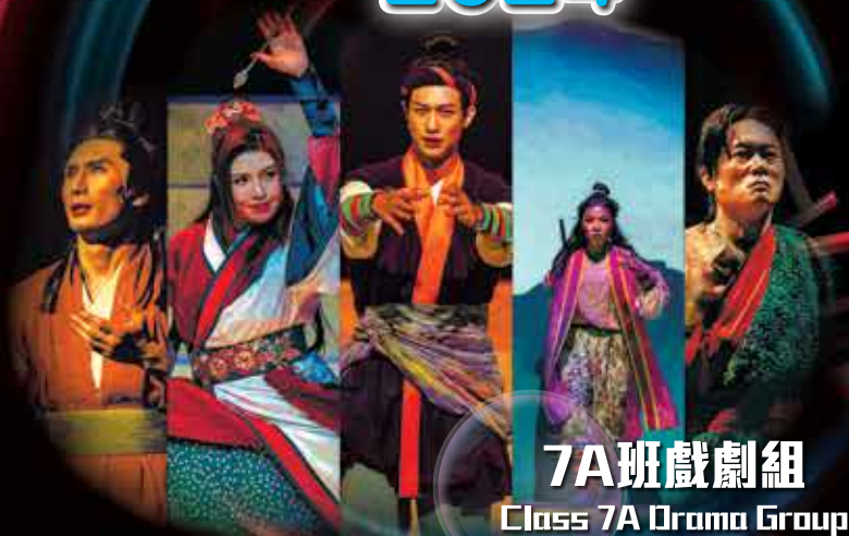
7A班戲劇組 Class 7A Drama Group