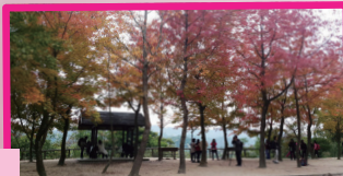
楓香林 Sweet Gum Woods