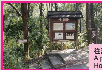
往河背水塘小徑 A path to Ho Pui Reservoir