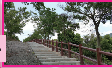
沿登山徑尋打咚咚石 Follow the Uphill Path to Ta Tung Tung Shek