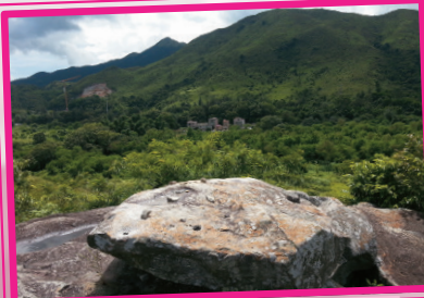
打咚咚石前方為禾徑山村和樟樹王位置 Ta Tung Tung Shek、Wo Keng Shan Village and Camphor Trees