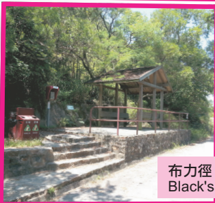
布力徑 Black's Link