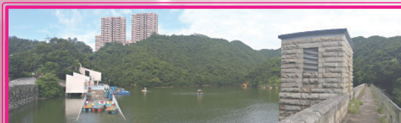
黃泥涌水塘 Wong Nai Chung Reservoir