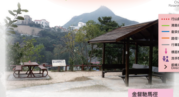
金督馳馬徑 Sir Cecil's Ride