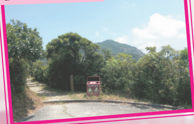
小徑往中峽 A Path to Middle Gap

- Take Citybus Route No. 11 to MTR Causeway Bay Station.