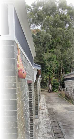
圓墩古村 Yuen Tun Old Village