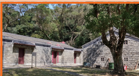
圓墩 Yuen Tun