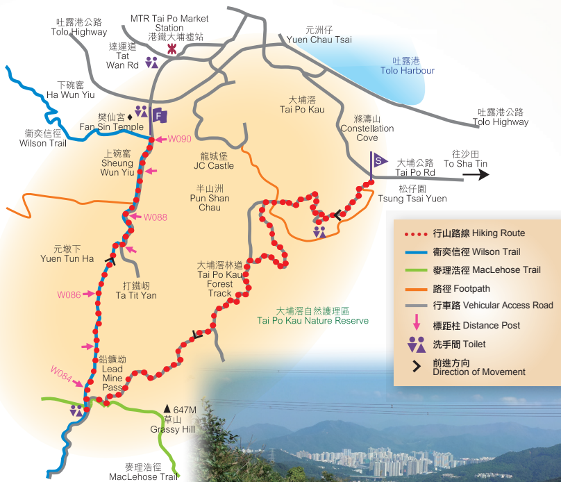
大埔全景 A Full View of Tai Po