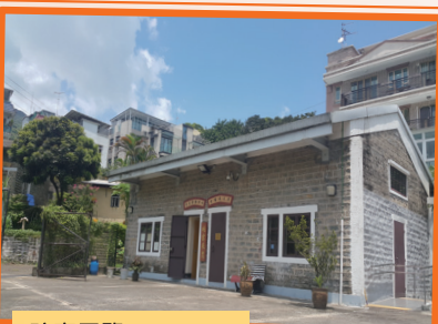
碗窰展覽 Wun Yiu Exhibition