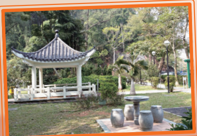
大埔滘花園 Tai Po Kau Garden