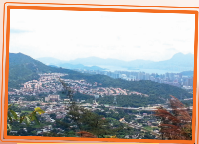
牛牯嶺遙望大埔 Looking toward Tai Po from Ngau Kwu Leng