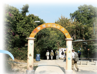
蝴蝶山行山徑 Wu Tip Shan Path