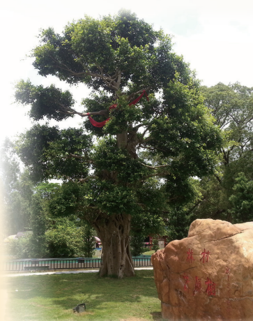
林村許願樹 Lam Tsuen Wishing Tree