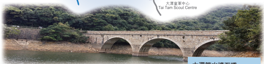
大潭萬水塘石橋 Tai Tam Tuk Reservoir Masonry Bridge