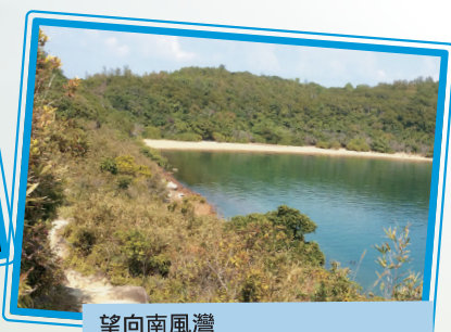
望向南風灣 Looking toward Nam Fung Wan