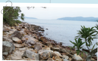
崎嶇小徑 Rugged Footpath