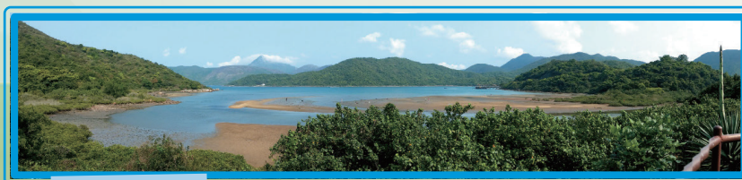
大灘海 Long Harbour