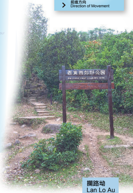
攔路坳 Lan Lo Au