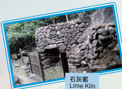
石灰窯 Lime Kiln

- Take green minibus Route No. 7 to Sai Kung Town Centre.