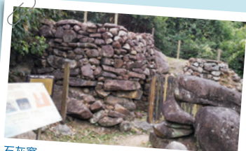
石灰窯 Lime Kiln