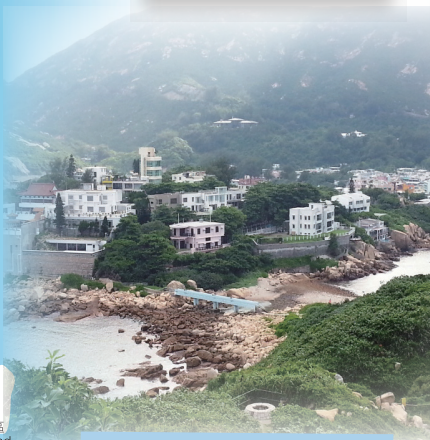
石澳海角郊遊區 Shek O Headland Picnic Area