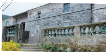
白沙澳 Pak Sha O