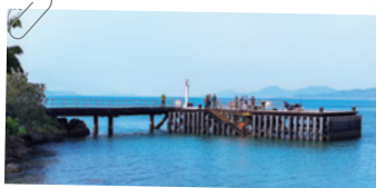
渡輪碼頭 Ferry Pier