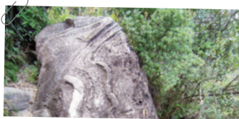
蛇石 Strange Rock