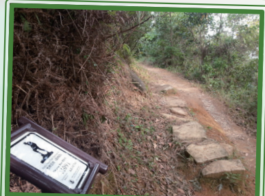
麥理浩徑 MacLehose Trail