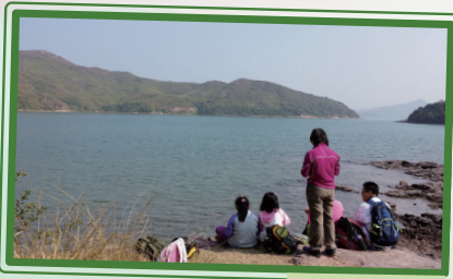
三桠灣 Sam A Wan