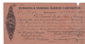
香港上海滙豐銀行匯票 Demand draft of the Hongkong & Shanghai Banking Corporation