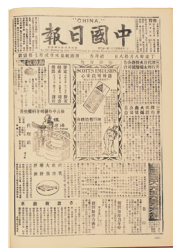
《中國日報》 China Daily