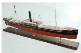
比例模型船：佐渡丸 (1 : 80 ) Scale model of the Sado Maru (1 : 80 )