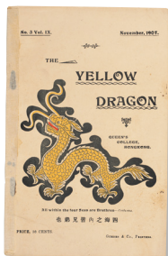
皇仁書院校刊《黃龍報》 The Yellow Dragon, the school magazine of Queen's College