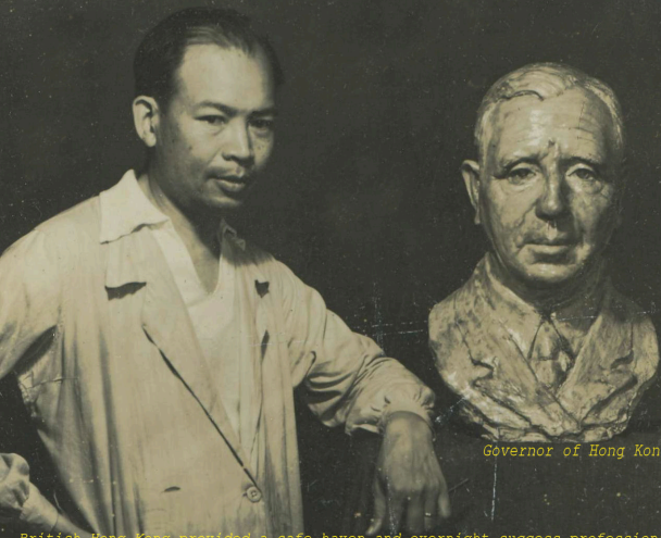
Governor of Hong Kong

British Hong Kong provided a safe haven and overnight success professionally - only to be shattered again four and a half years later when WWII spread to the Pacific. His fame worked against him when he had to flee under darkness because the conquering Japanese wanted him to make a monument to the emperor - which would have been regarded as collaboration.