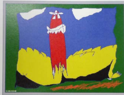
A/P Soft Off 25-2-2008