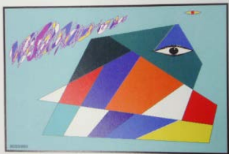
A/P Eye in Eye 13-10-2007