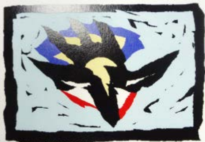
A/P Head 1-3-2008