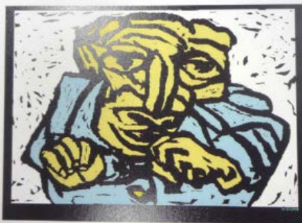
A/P Old Man 6-1-2008