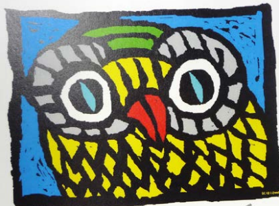
A/P Owl 12-1-2008