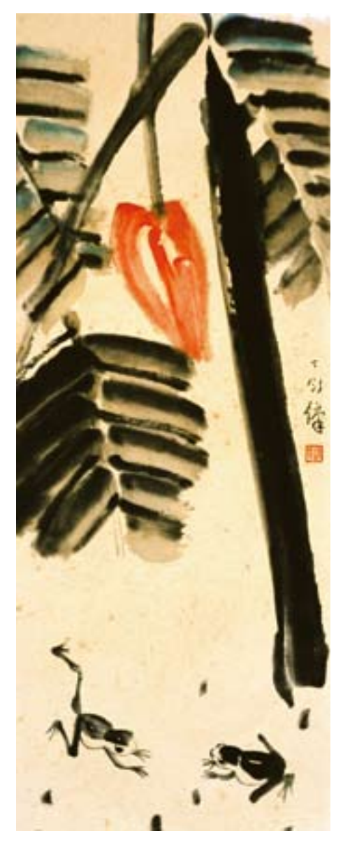
Ding Yanyong Banana Plant and Frogs ca 1946 Collection of Museé Cernuschi, Paris

In June he took part in the Exhibition of Contemporary Painting of China held in Museé Cernuschi, Paris. His painting, Banana Plant and Frog , was acquired by the Museum after the exhibition. The fact that he was represented in this