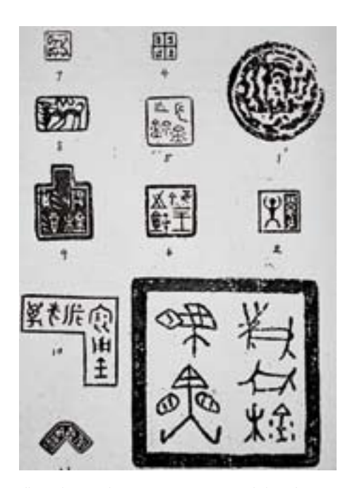
Illustration to Ding Yanyong's essay on archaic seals