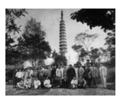
Staff and students of Zhonghua University of Fine Arts on a painting excursion in Hangzhou in 1926

He presented a solo exhibition of his oil paintings at Zhonghua University of Fine Arts, Shanghai.