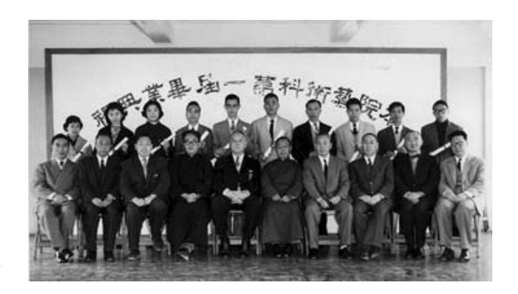
The first graduation class of the Fine Arts Programme, New Asia College, taken at New Asia College in 1959

(1891-1968), Liu Bingheng (1915-2003), Chen Jinghong (1903-1992) and Mai Yusi (1910-1992) to teach courses in Chinese and Western art. The Department ran for only two years.