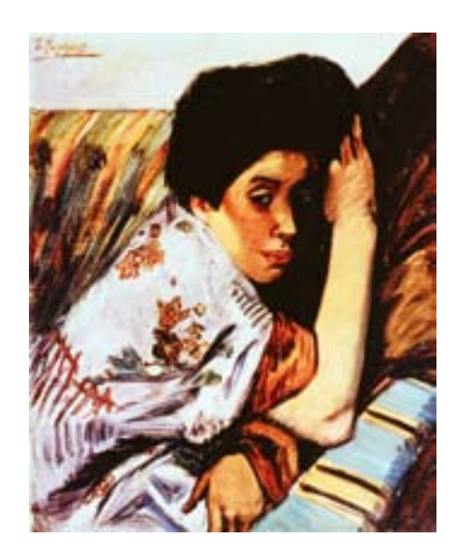
Fujishima Takeji Lady dated 1913. Collection of Tokyo National Museum of Modern Art ( Fujishima Takeji . Kanvasu Nihon no meiga 6 (Famous Japanese Paintings on Canvas 6) (Tokyo: Chuo koron Press, 1979), plate 24)

After his arrival in Tokyo in autumn, he started to learn Japanese and enrolled in the Kawabata Painting School to improve his drawing skills. Established in 1909, the Kawabata Painting School had a Western Painting Department headed by Fujishima Takeji (1867-1943), who attracted students aspiring for free and personal expression in art. The seeds of his love for modernist art could have been planted during this period of study.