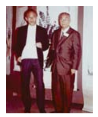
Ding Yanyong and Zhao Wuji at the Paris Exhibition in July 1973