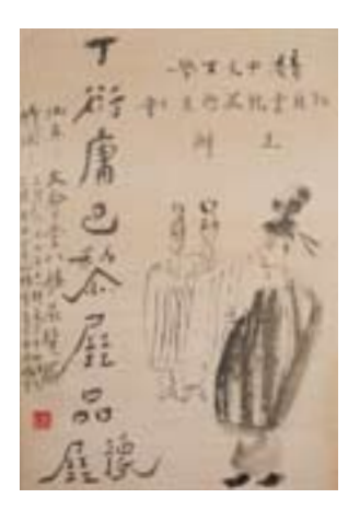
Poster of the Hong Kong Preview of the Solo Exhibition in Paris painted by Ding Yanyong in 1973