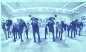
廖芳炎 野牛乳工廠 1997/98 Vincent Leow Mountain Cow Milk Factory 1997/98