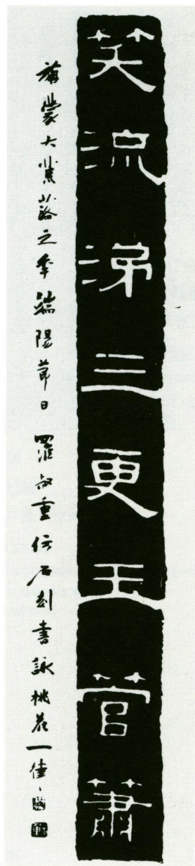
14 羅叔重 仿石刻隸書七言律詩(部份) LUO Shuzhong Poem in clerical script (section)