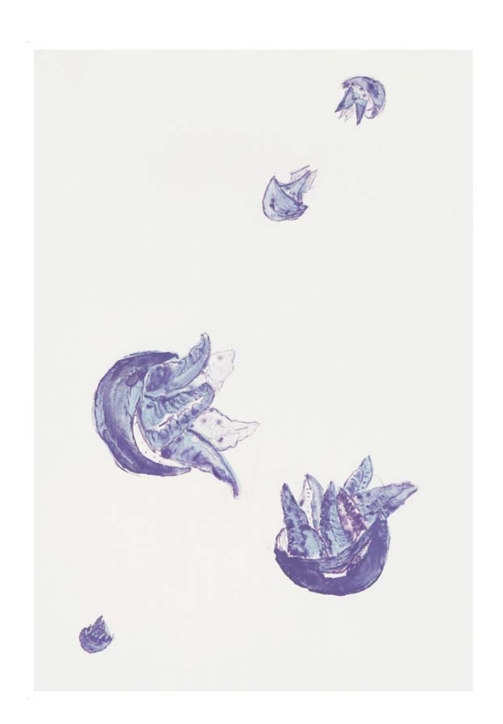
Dancing in Water No.27 / 2011 Waterless Lithograph