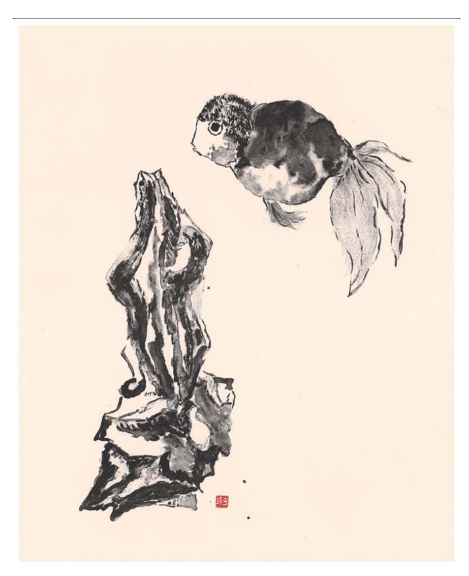
Fish and Fun No.1 / 2000 Lithograph