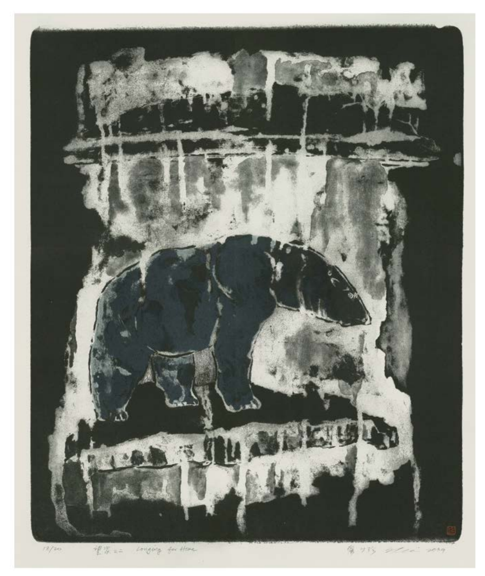
Longing for Home Series No.2 / 2009